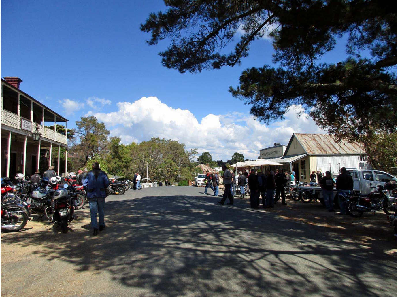
Easter Rally Entrants at Hill End